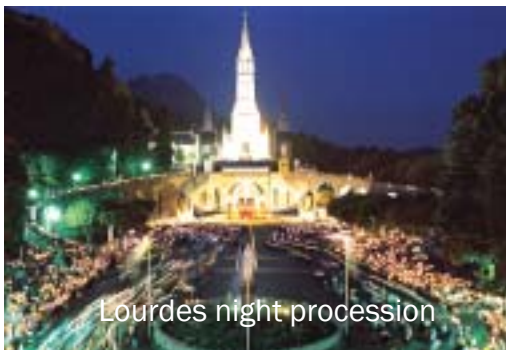
Lourdes night procession

The next Gathering will be held next January in a site yet to be determined. ♦