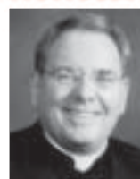
Archbishop John Myers

For information call: 1-800-559-1540 access code #28 For hotel reservation: 1-800-325-1717 Website: www.afccpc.org