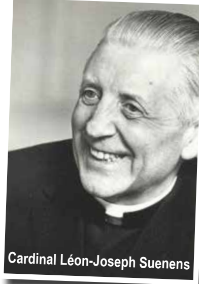
Cardinal Léon-Joseph Suenens