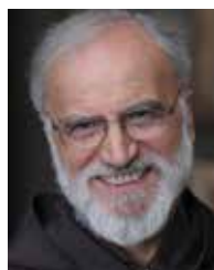
Fr. Raniero Cantalamessa, OFM, Cap is Preacher to the Papal Household since 1980 and Ecclesiastical Assistant of CHARIS. He is a ten-year member of the Catholic delegation for the Dialogue with the Pentecostal Churches. He is frequently invited to speak at international and ecumenical conferences and rallies.

Let us conclude with some famous words of St. Augustine: “Just as at that time the languages of all nations indicated the presence of the Holy Spirit, in the same way, he is now indicated by the love of the unity of all nations. The time you can be sure you have the Holy Spirit is when you consent through sincere charity firmly to attach your minds to the unity ” ( Sermon 269, 2, 4 ). ♦