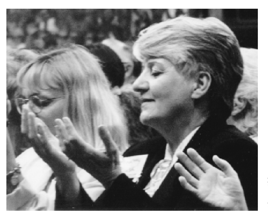
At every Mass we have the opportunity to offer ourselves with Christ to the Father.

It should go without saying that it makes a difference if people, especially those serving in ministry, have already spent time in prayer, seeking God's blessing on those who will be attending and asking God's direction and guidance for the message and the music. It is important that those who are ministering should have repented of any sin in their lives and have consciously given to the Lord any burdens or resentments. It is also vital that the presider has already touched base with the other ministers about the flow of the service and their roles in it and is able to pray with the other ministers before the Mass. This could be a time of binding any negative spirit and of coming into a greater unity with all who are ministering and a deeper focus on the Lord and attention to his guidance.