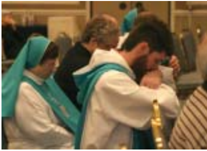
Intercessors of the Lamb pray at National Leaders' Conference 2003.

“New Covenant Power,” a weeklong retreat/conference will be held July 5 th through the 10th at the Qwest Center in downtown Omaha and will focus on contemplative spirituality and intercessory prayer. The event, organized by the Intercessors of the Lamb, will offer daily teachings, guided Scripture meditations and individual prayer as well as full day youth tracks, an adoration chapel, opportunities for the Sacrament of Reconciliation and a bookstore—all on site.