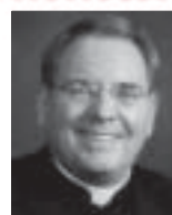
Archbishop John Myers

For information call: 1-800-559-1540 access code #28 For hotel reservation: 1-800-325-1717 Website: www.afccpc.org