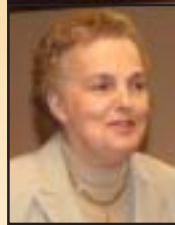
CD & DVD: Aggie Neck – Stirring the Fire of Pentecost