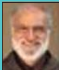
Fr. Raniero Cantalamessa