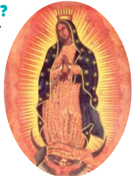
CONTACT FIAT Catholic Pilgrimages 916 N. Western Avenue, Suite 225 San Pedro, CA 90732